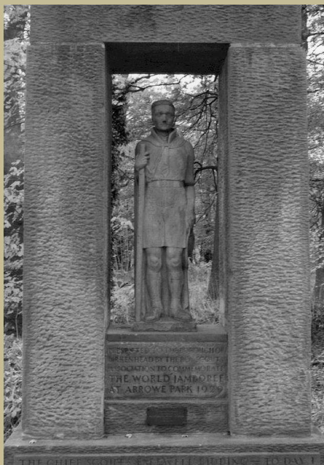
Memorial of the Jamboree now situated in grounds of Arrowse Park Hospital