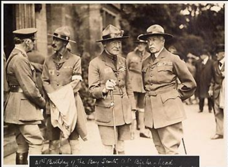
21 st Birthday of the Boy Scouts, 1910. Baden-Powell The Duke of Connaught and Sir Robert Baden-Powell