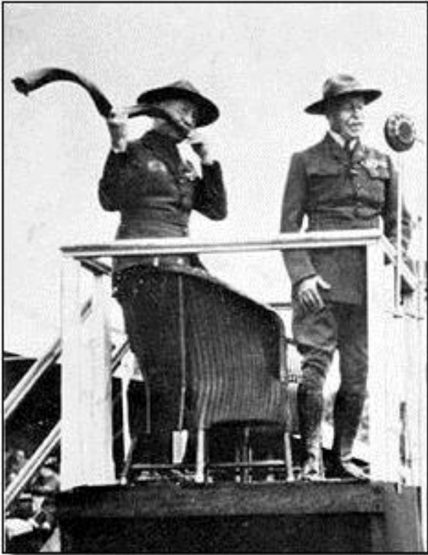
Lord Baden Powell sounds the Kudu Horn to open the meet at Arrowe Park